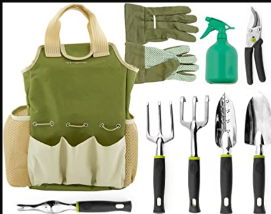
Vremi 9 Piece Garden Tools Set

5. Use a wheelbarrow or a similar device to move heavy containers. You'll be surprised how heavy the pots can get once you fill them up with soil.