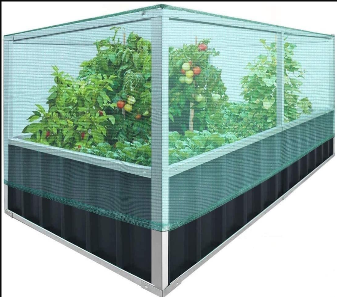
KING BIRD Raised Garden Bed with Garden Anti Bird Protection Netting

Perfect for growing strawberry, carrot, pepper and other fruits, root vegetable, especially for protecting seedlings.