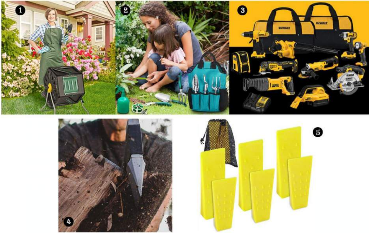
1. Miracle-Gro Small Composter